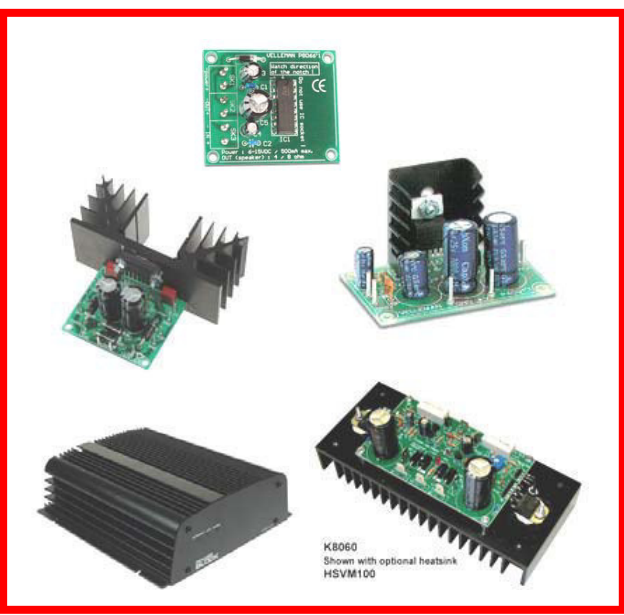
Power amplifiers E.g. K8066, K4001, K4003, K8081, K8060, ...